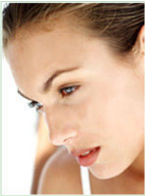
A Natural Look That Lasts Cosmetic Image Clinics

We are treating many clients with a natural longer lasting filler, -non-surgical facial contouring.